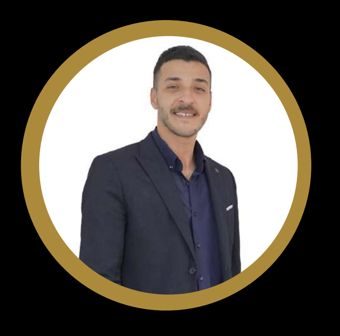
Ghassan Younis Photographer